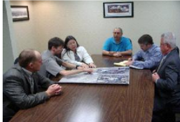
The gathering of eagles in Tahlequah to discuss a Cherokee Trail of Tears commemorative site.